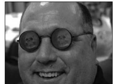
We hope to see you at the Summer Conference

Contact the Heidelberg House for reservations at 1-800-444-2812. Deadline for reservations is May 1st to guarantee room availability. Ask for the Wisconsin Coroners and Medical Examiners room block.