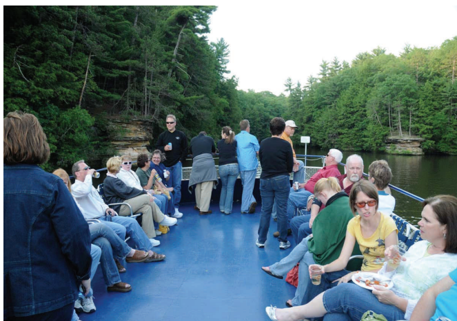
Boat trip on the Wisconsin River, sponsored by ATSF