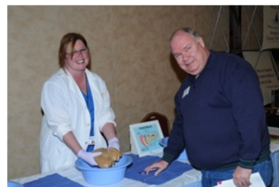
Wisconsin Donor Network, Live Organ Display