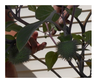
Pictured left: Plant with finger pointing to missing pod

Investigators were advised by the laboratory to go to the scene and recover a moon plant seed pod and determine what she may have consumed for dinner that evening. Further scene investigation included photos taken of the moon flower plant that was potted and located on the front porch. A sample of the plant was recovered for the lab consisting of branches, leaves and a flower bulb, and a second sample with branches, leaves and a seed bulb. Family stated that her dinner the previous night consisted of a hot dog on bun that contained small, round black seeds. The bun was retained for the laboratory as evidence.