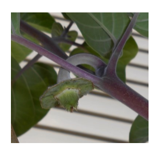
Pictured left: close up of branch without the pod